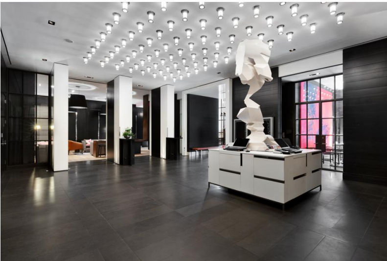
The lobby of Andaz 5th Avenue. ANDAZ 5TH AVENUE