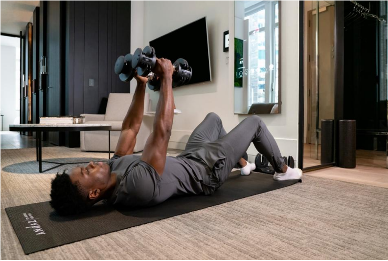
Wellness is the focus in some of the suites. ANDAZ 5TH AVENUE

Beyond art, Andaz 5 th Avenue is focused on providing an overall joyful and memorable guest experience. It offers year-round movie nights. It has a focus on wellness with yoga classes, plans to add more plant-based items to their menus, and new equipment in the onsite gym. It also offers Wellness Suites which are equipped with a spa-like sound bath, a mirror gym, and free weights.