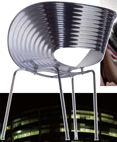
DESIGN LEGEND: Ron Arad and (left) his Tom Vac chair.