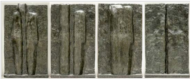
Back Towards Flat Digital C -Type, Edition of 3

Sexy lads are not the only art objects that take Hornby's interest. Back Towards Flat uses Matisse's original bronzes ( The Back I-IV , 1908-31) as source material. He hired a Photoshop expert to morph images of the famous voluptuous nude backs into a final harsh bronze gash. He is highlighting the erotic in a way that Matisse may have found extreme. But Hornby also recalls Gustave Courbet's infamous L'Origine du Monde (The Origin of the World, 1866), the detailed realistic oil painting of the junction of a nude woman's open thighs, which was bought by Jacques Lacan in 1955 before ending up in the Musée d'Orsay in lieu of death tax. In the game of appropriation it seems the state is always the winner.