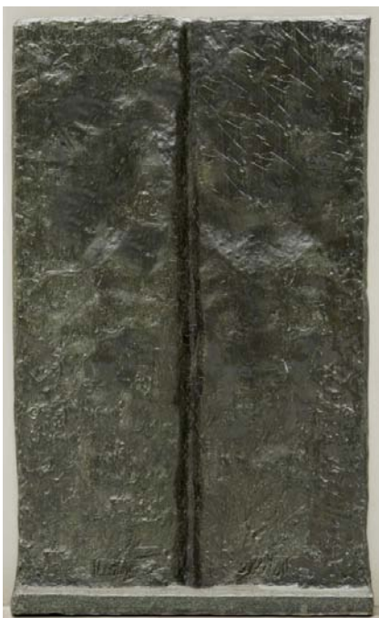
Back Towards Flat, detail