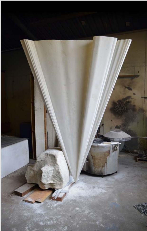
The Present is just a Point , (work in progress), 2013, Marble resin composite, Aluminum

Artist, Curator and Author, director of MOCA London