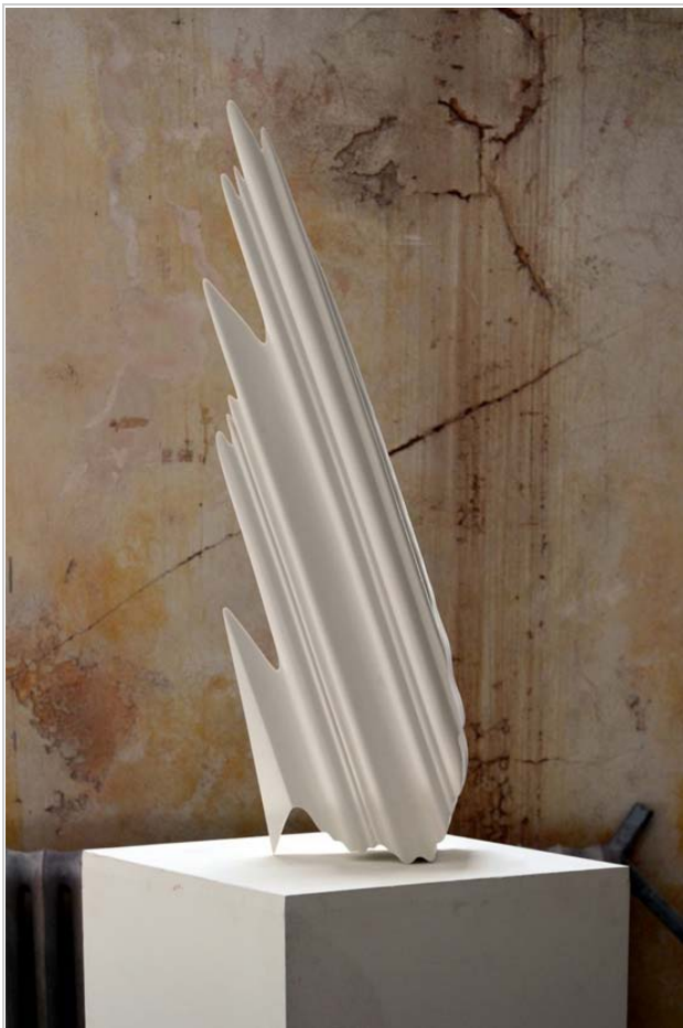
6° Takes One Minute, 2013, Resin, Edition of 3