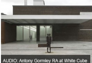
AUDIO: Antony Gormley RA at White Cube