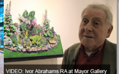
VIDEO: Ivor Abrahams RA at Mayor Gallery