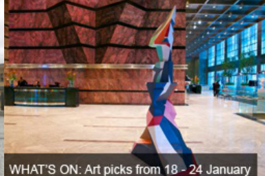
WHAT'S ON: Art picks from 18 - 24 January