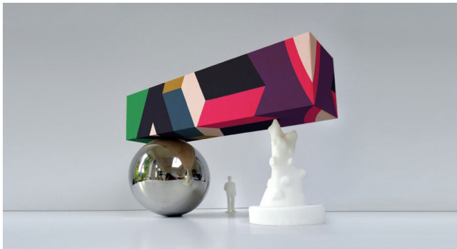
Nick Hornby, Sonta Tantra collaboration proposal for Kensington 2014

therefore you are entirely in the picture, whereas when you are reading a book or watching television you can see your Victorian china coffee cup, your plastic Japanese television, you're conscious of your slightly misfitting trousers, so all those senses of reflective are subconsciously blending into the narrative you are reading.