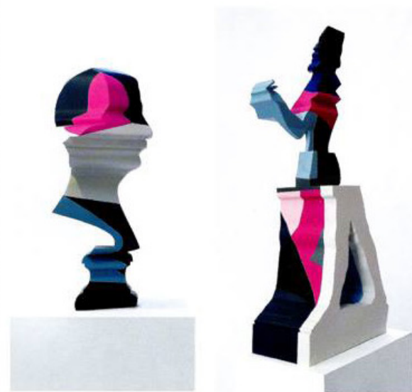
Above left: Nick Hornby & Sinta Tantra, Patron: Experiments in Color #2 , 2015, marble resin composite, paint, 60 x 27 x 35 cm. Unique. Above right: Nick Hornby & Sinta Tantra, Yes, Yes, in Chinese Blue, Hague, Cornforth, Telemagenta, Railings, Lush Pink and Drawing Room , 2015, marble resin composite, paint, 200 x 100 x 46 cm. Unique.

art historian and curator Ts. Uranchimeg.